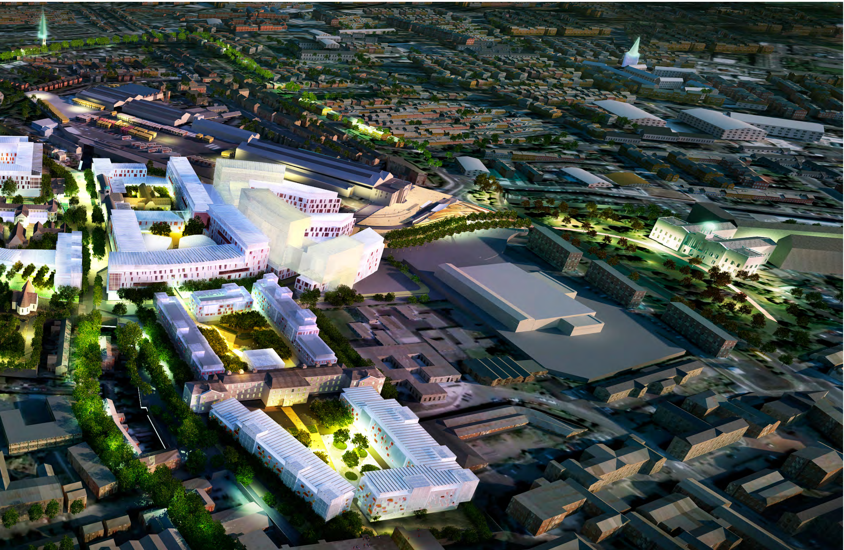
1. view of the site from the south

The new Grangegorman Quarter creates inviting spaces for the community while maintaining connections to the site's past and linking together areas of the city.