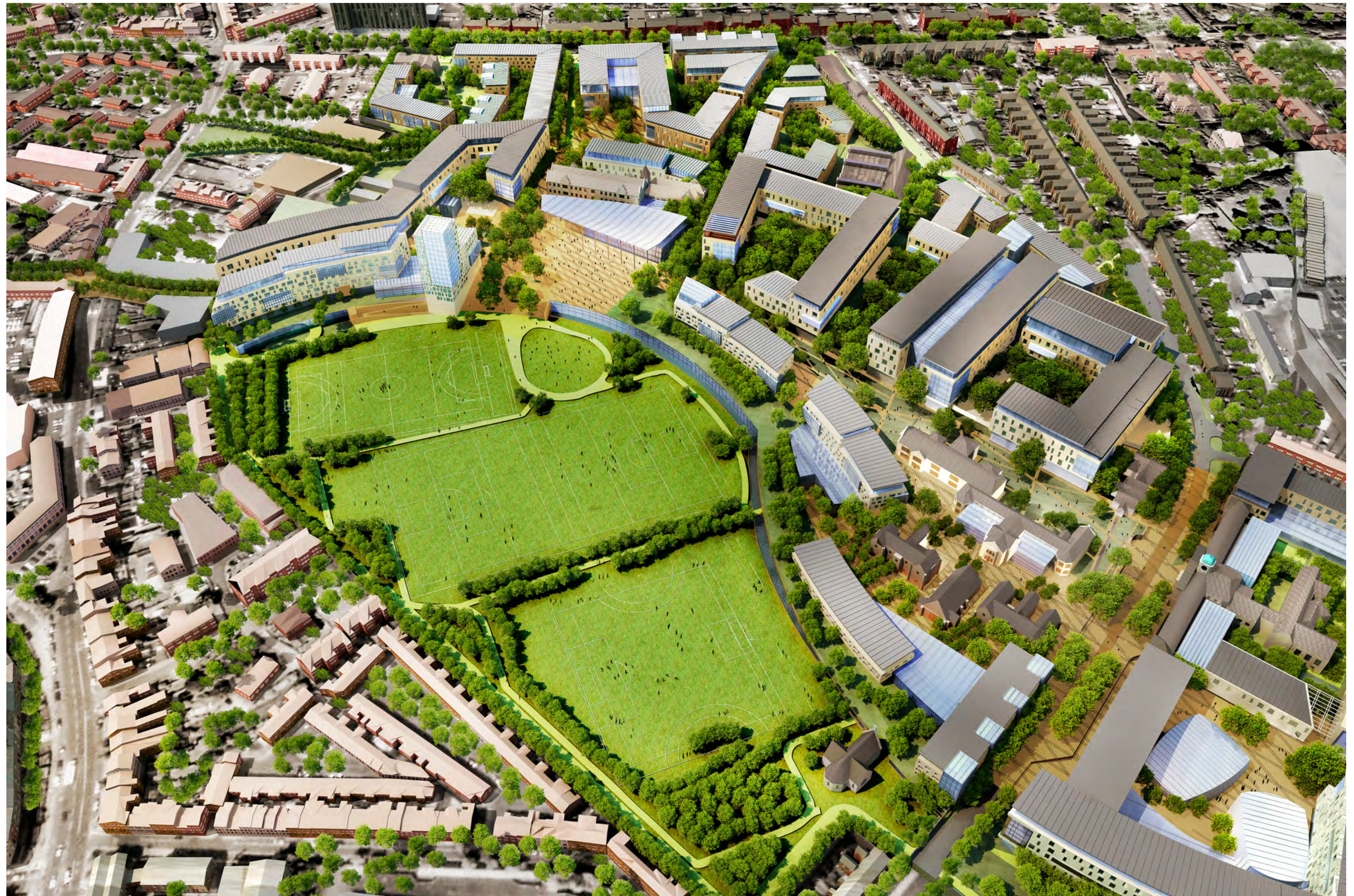
1. view of the fields

The majority of the development is located on the northern portion of the site to maintain the existing landscape and open space to the south.