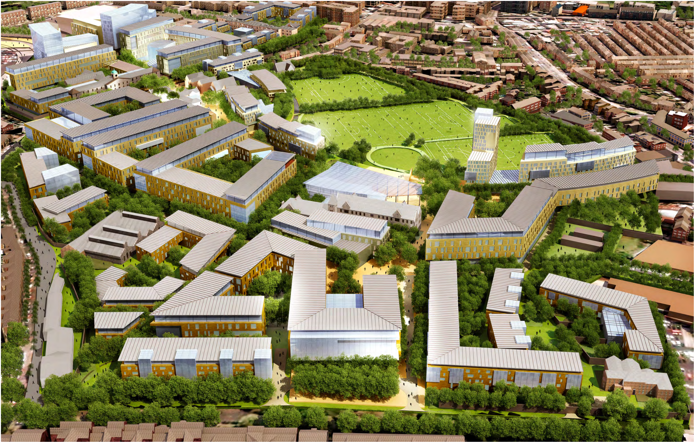
1. view of the site from the north

A series of quadrangles and courtyards are linked by both urban and landscaped pathways to form a legible and interconnected area.