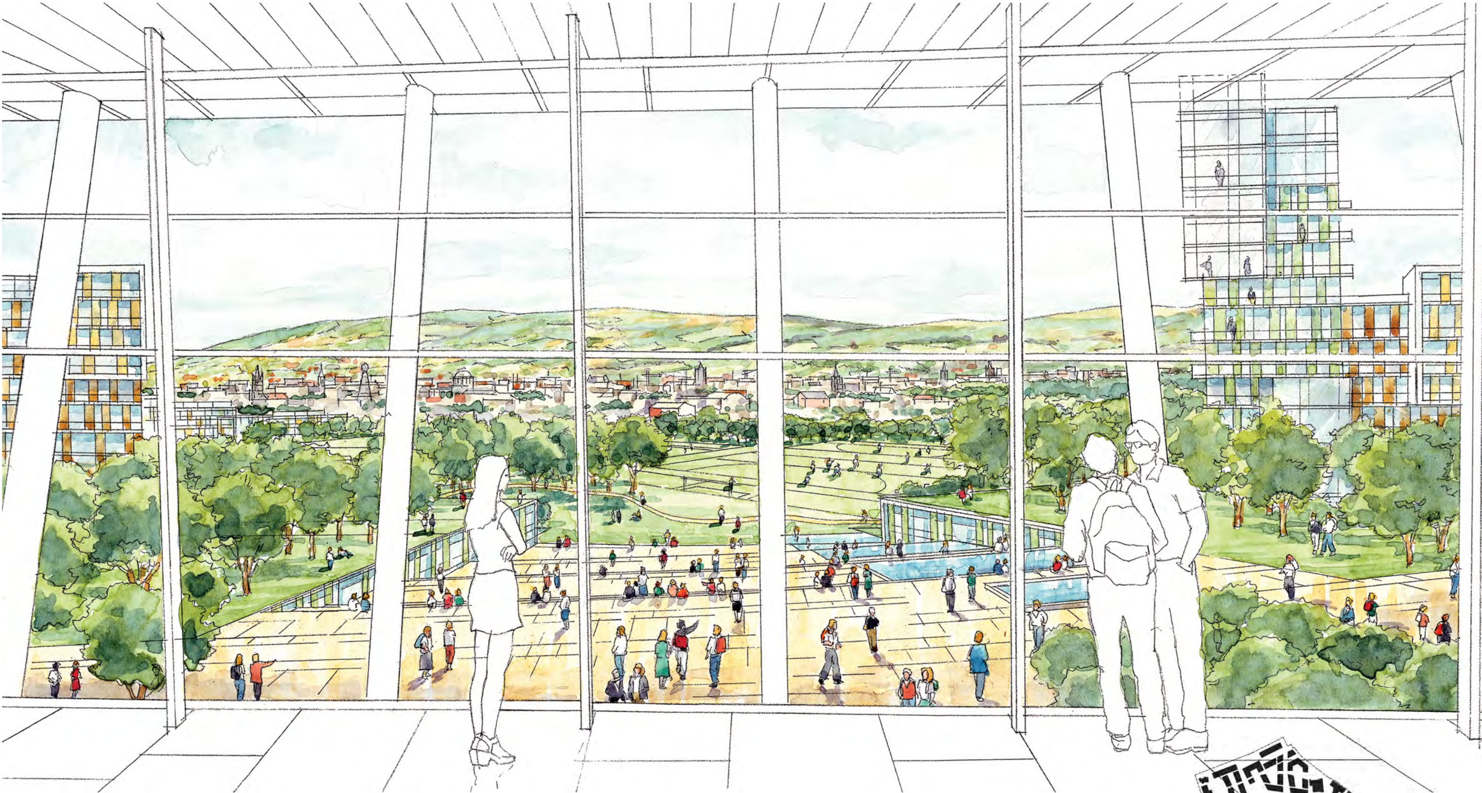
1. view from the DIT library

The Institute's Library anchors one of the central hearts of the quarter. Its location creates an intellectual hub of activity at the intersections of several primary circulation routes and provides iconic views from the Upper Terrace and the Fields out to the city of Dublin and the mountains beyond.