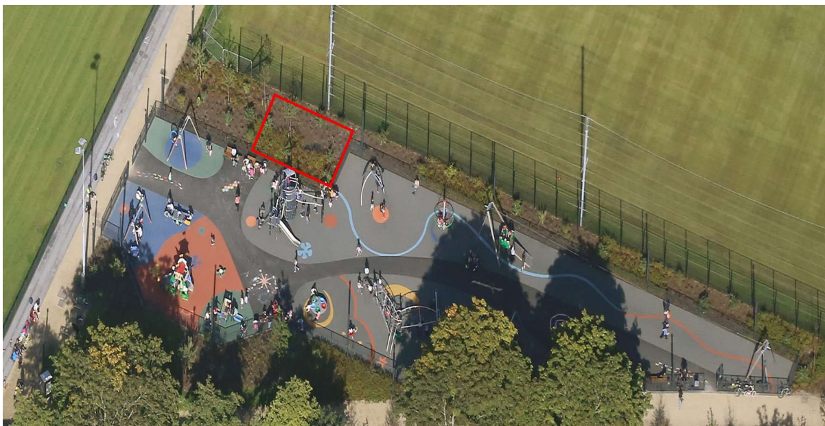
Site of the ability swing position (marked by red box) within the Grangegorman playground

The swing being installed is EN compliant to European standards, certified and fully accessible for wheelchairs and can accommodate two wheelchair users at a time.