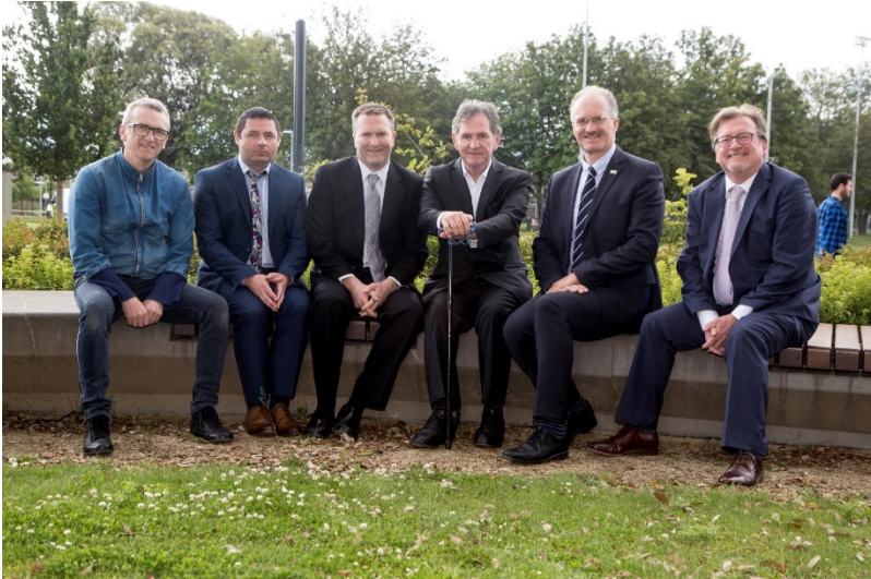
Launch of Pathway 1 commission