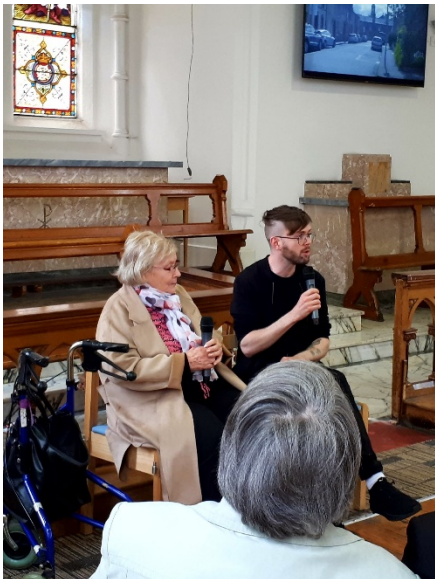
Launch of One Hour Archive