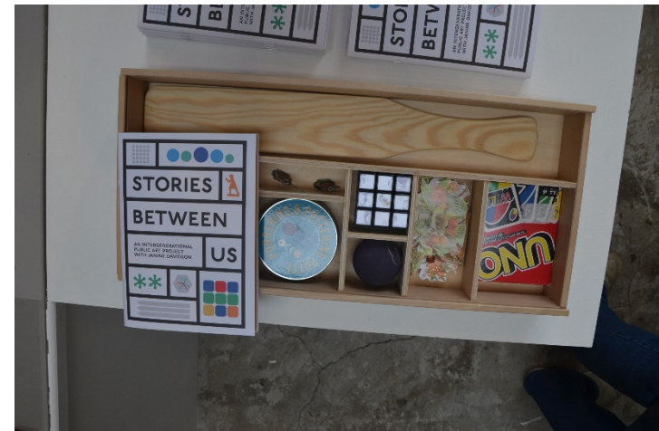
Launch of Stories Between us