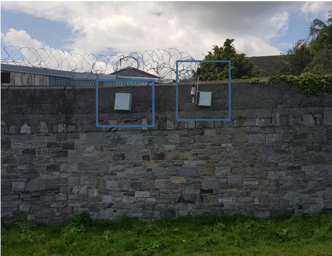
Figure 1 Image of Noise, Vibration and Dust Monitors at site boundary wall.

One Dust monitor (D1) at the site boundary wall with Prussia Street.